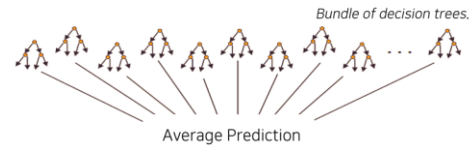
Figure 3. Random Forest process

Among the various methods for air temperature estimation, this study applies the statistical model, “Random Forest” which is one of the Machine Learning approaches. Ho et al. (2014) suggested this technique as an urban air temperature estimation.